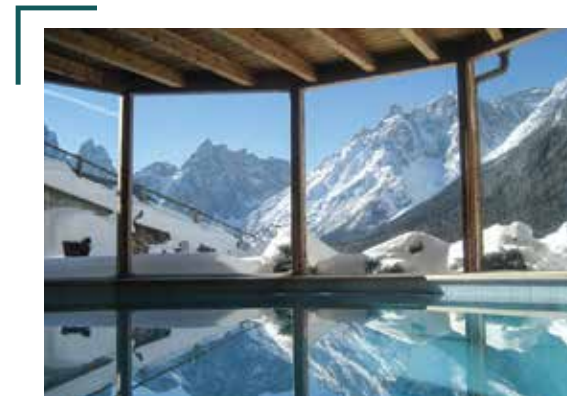
PERSONALIZED JACUZZI VILLA